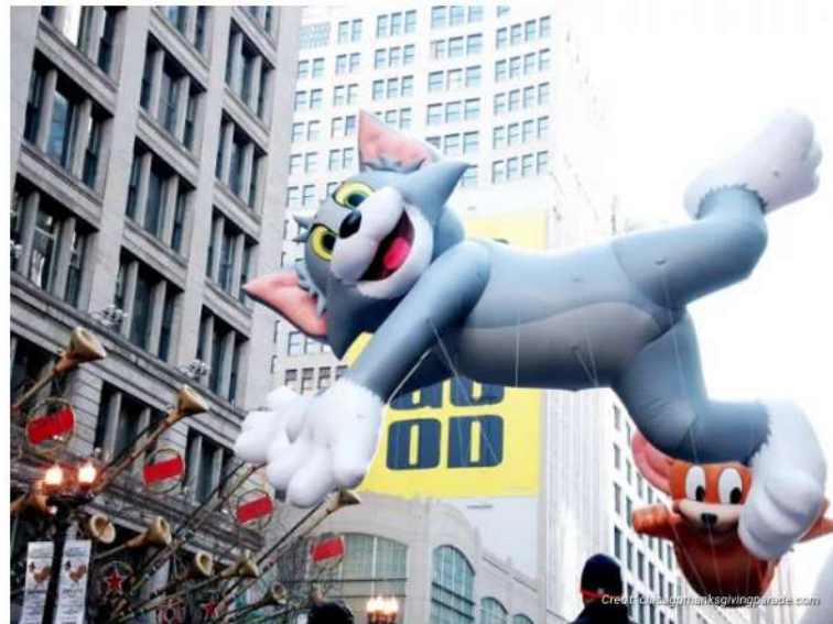
Chicago Thanksgiving Parade - Chicago

The Chicago Thanksgiving Parade is a three-hour-long spectacle that starts at 8 a.m. on State Street. It includes enormous helium balloons, floats, marching bands, equestrian units, unique performance groups, local and national celebrities as well as rhythmic drum lines and dance troupes.