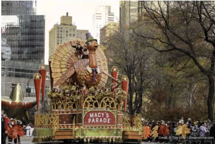
Macy's Thanksgiving Day Parade - New York City