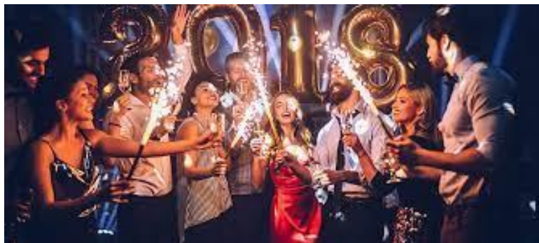
Many people have a party with friends and family to ring in the new year.