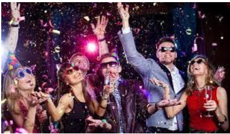
People all over the world celebrate New Year's together!