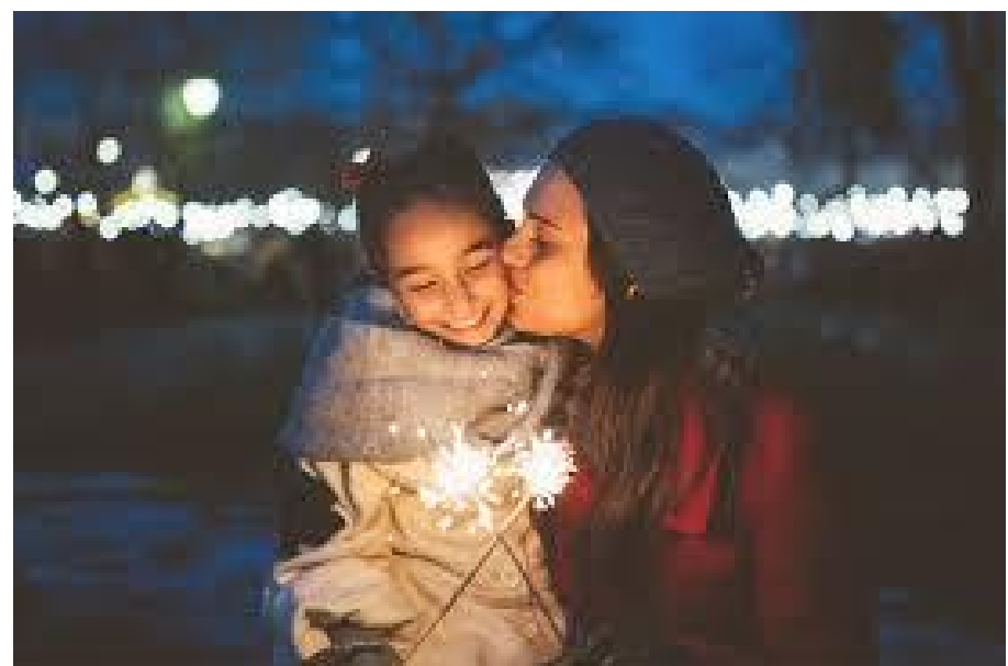
It's tradition in many countries to kiss a loved one at midnight on New Year's.