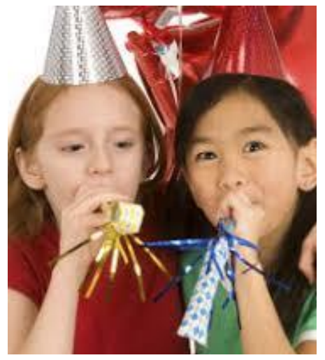
It's fun to blow noisemakers on New Year's Eve!