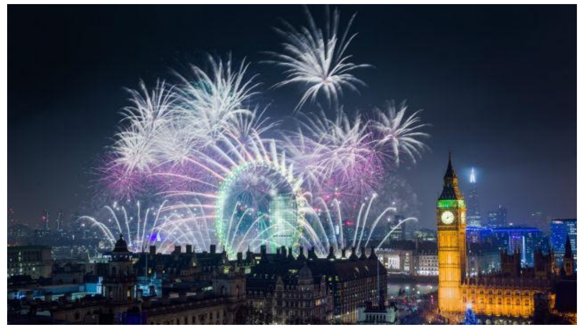
Cities all around the world have fireworks displays at midnight on New Year's Eve.