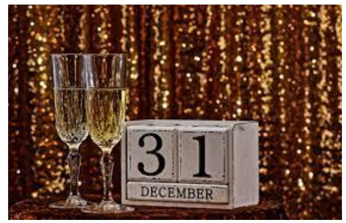
December 31st is the last day of the year and what we call New Year's Eve .