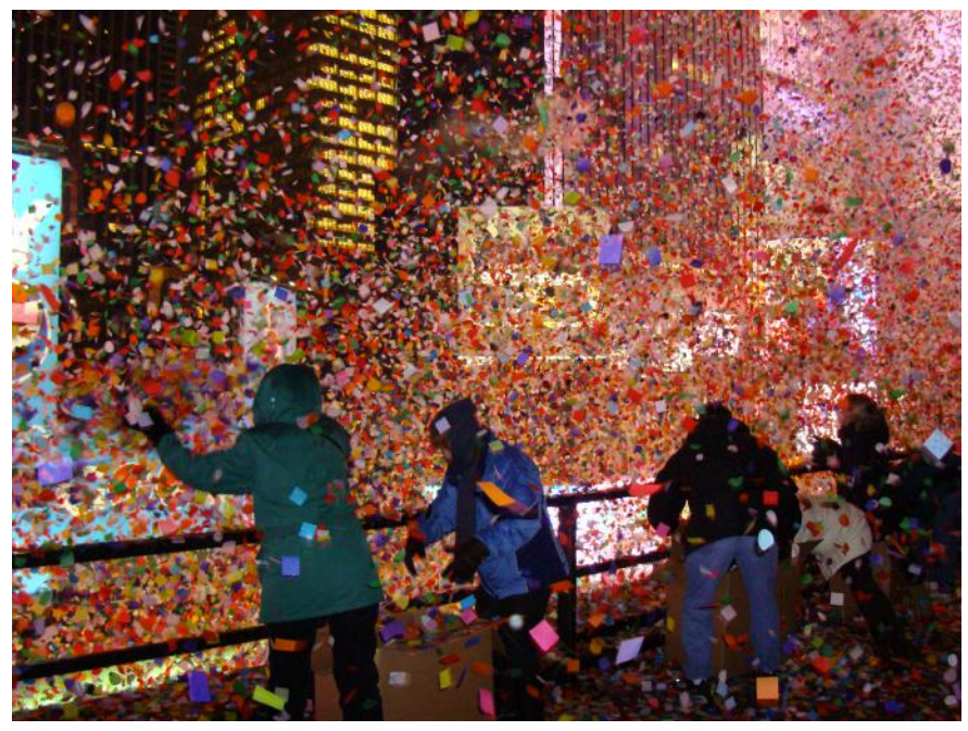
Confetti flies through the air at midnight to celebrate the beginning of the New Year!