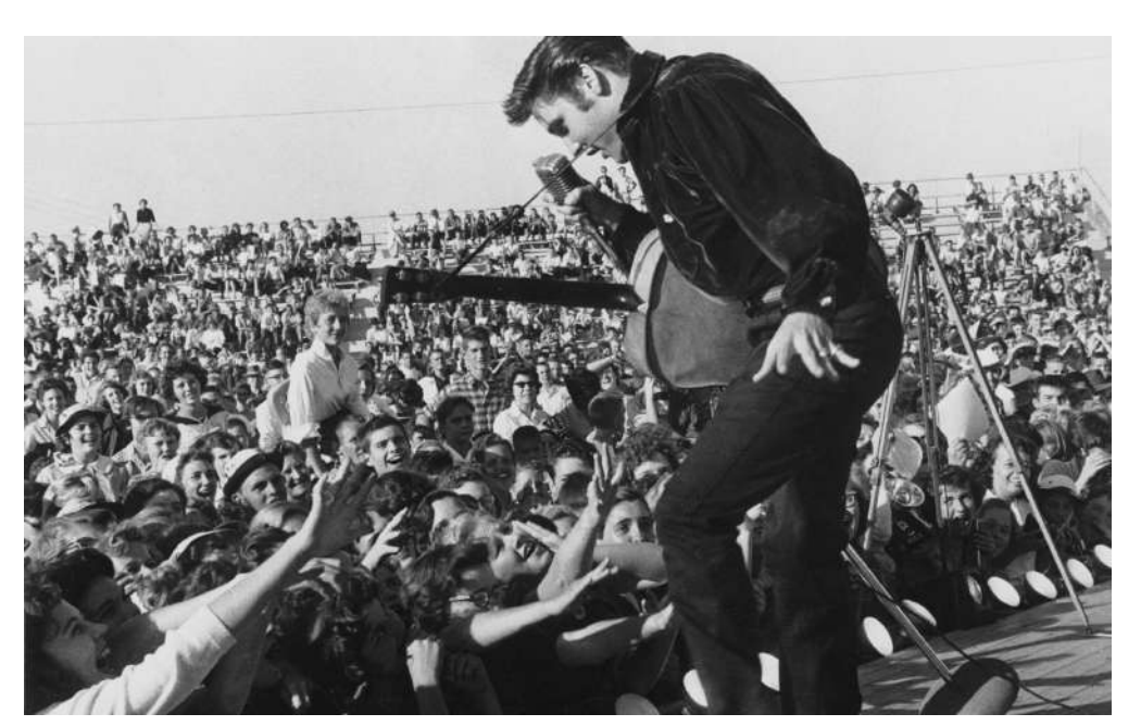
Activity 8: Look at the pictures and discuss what you think is happening:

In your books create a new instrument. Draw and explain in English your new creation - the features, what genre of music is it for, how does it work and why have you chosen it? \dots