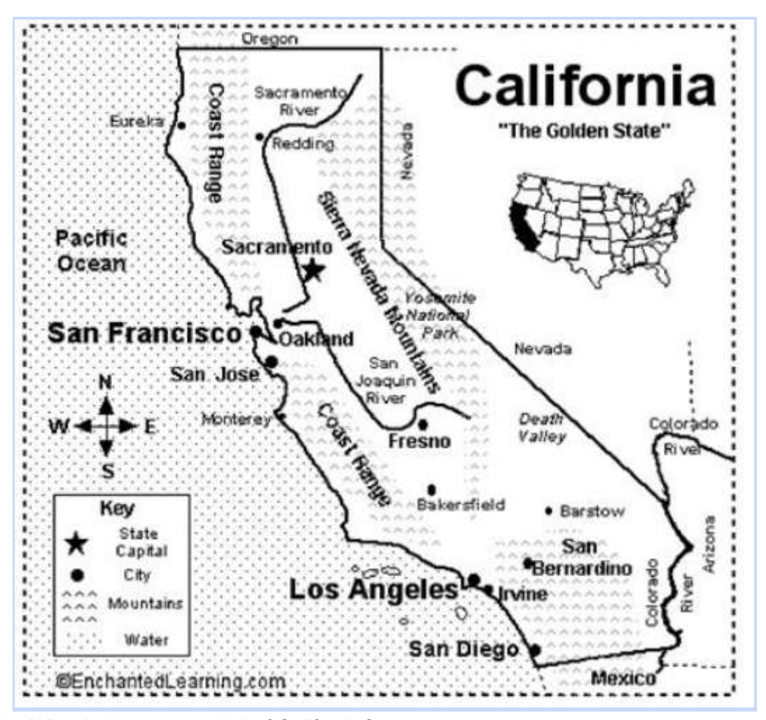
Activity 4: What do you know about California? See if you can answer all the following questions with your partner: