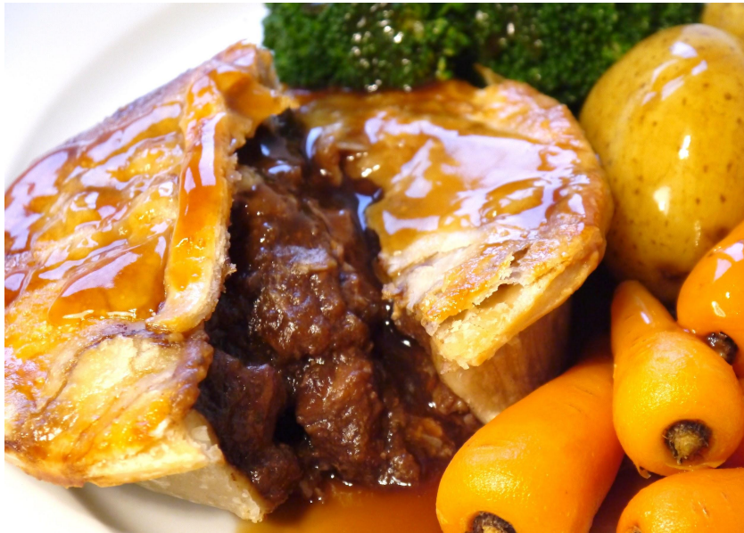
This is a traditional British dinner. I can see a steak pie, carrots, potatoes and broccoli.