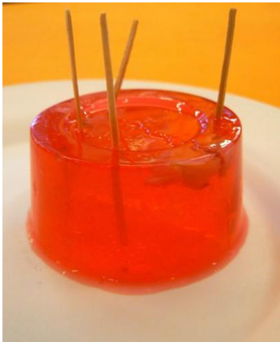
This is a traditional English dessert. It is jelly.