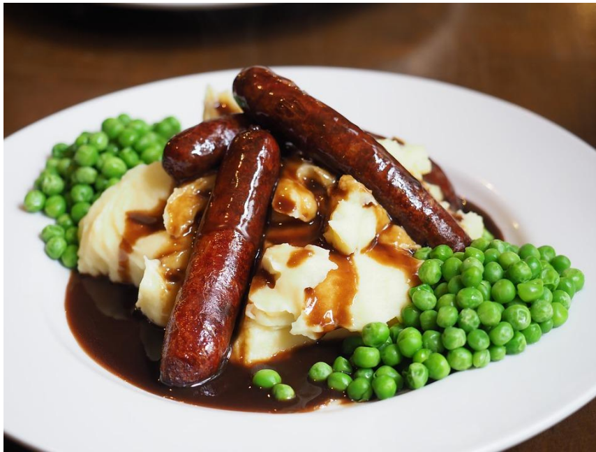
This is traditional British pub food. Bangers and Mash. I can see sausages, potatoes, peas and gravy.