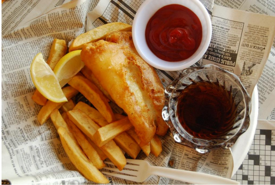
This is traditional British seaside food. Fish and Chips. It is served on newspaper with tomato sauce and vinegar.